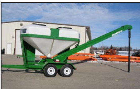
2 - 145 unit poly tanks with independent slide controls