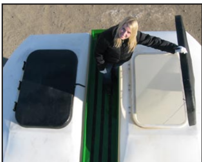
2 – 45" X 27" sealed lid openings with 18" wide catwalk