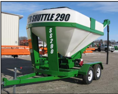
Heavy duty trailer option