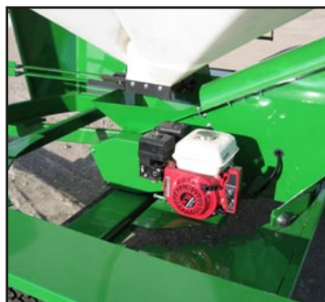
5.5 Honda motor, battery and variable flow controls