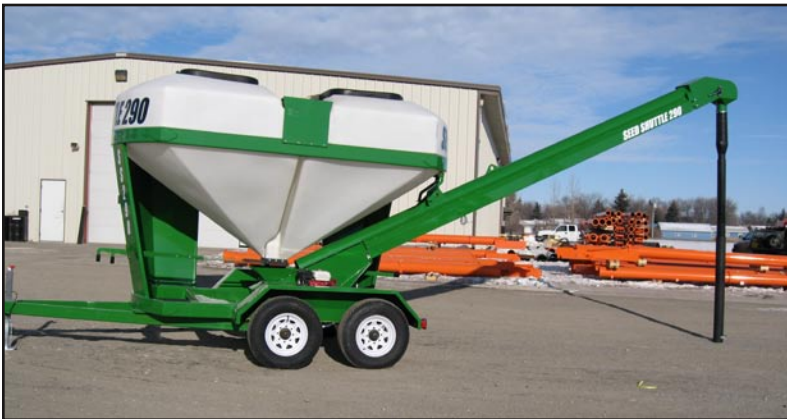
8" diameter tube, 10" wide all rubber belt and a 23' long conveyor for extra reach